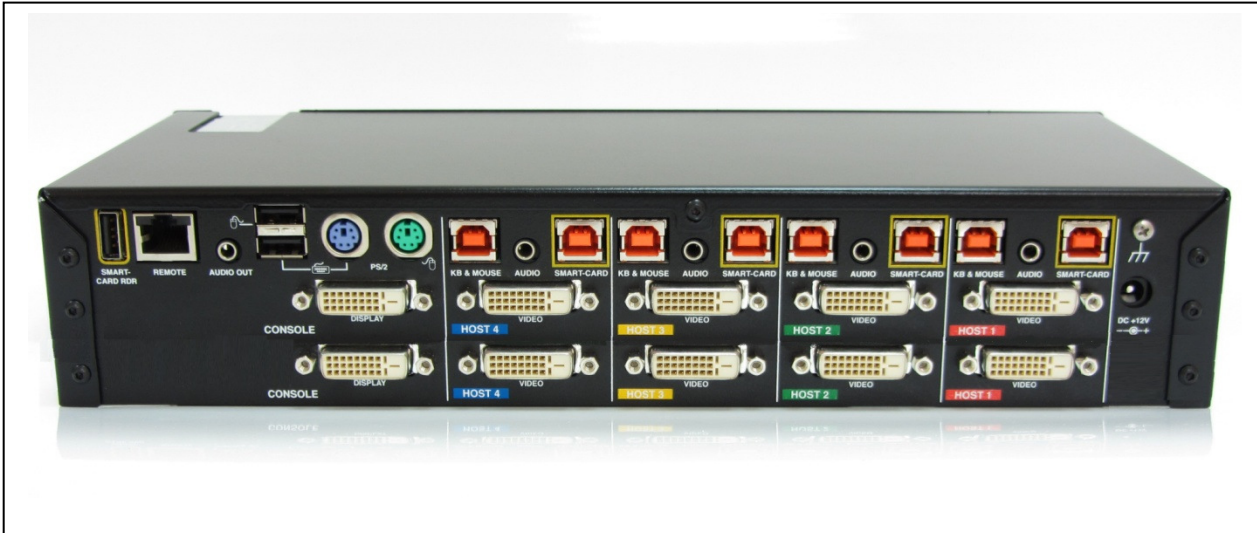
K244E Rear panel