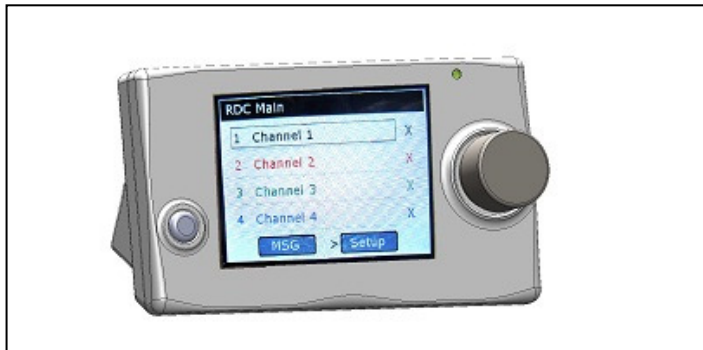
Optional Remote Desktop Controller RDC440